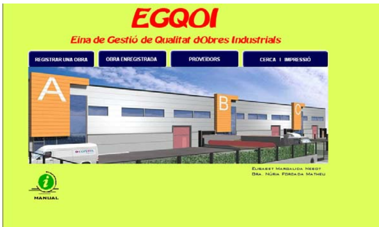
Figure 3. Main page of SIDEM