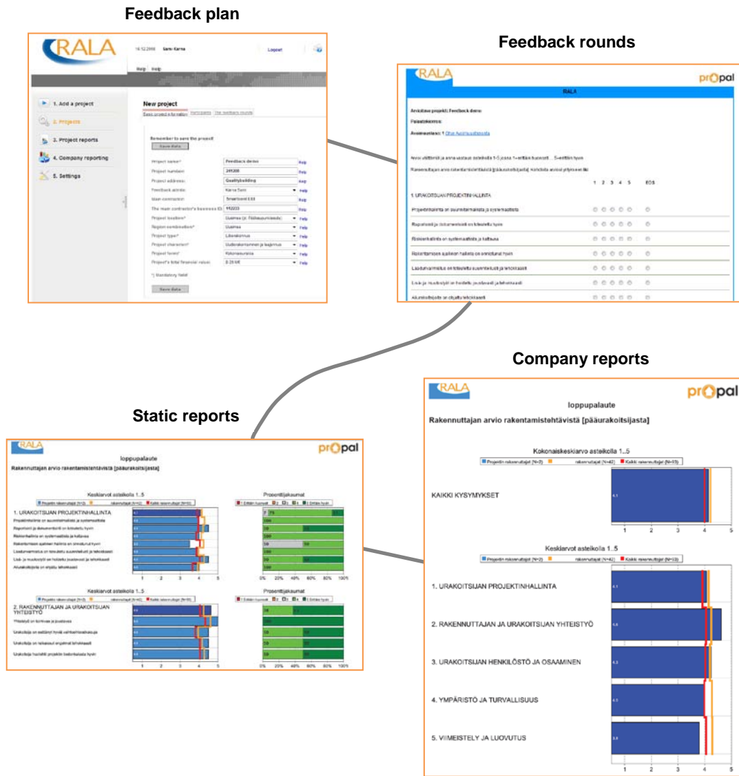
Figure 2. Operational model of the feedback system.