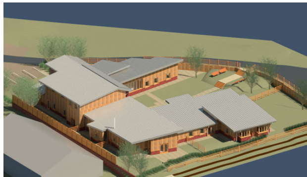
Figure 2. A community development project as a case study