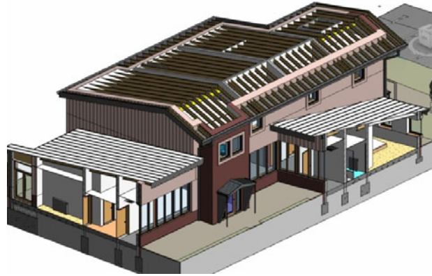
Figure 3. A screenshot from the cloud live environment