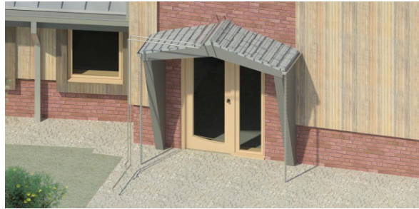
Figure 5. Pipe work outside of Building fabric

architectural drawings two week ahead other disciplines. As each discipline's work-set is locked to other disciplines, some clashes were originated. For example, in figure 5 some M&E pipes appeared outside the building fabric as a result in the position change of the building boundary. These issues are more process related and can be addressed in BIM PEPs.