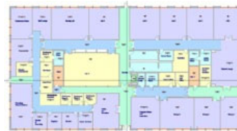
Figure 3. Model Floor