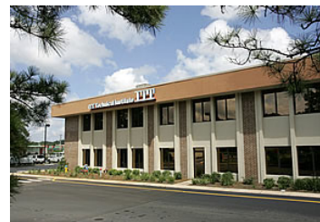
Figure 2. ITT Building.