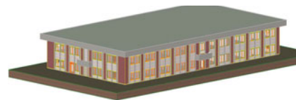
Figure 4. BEM Model.