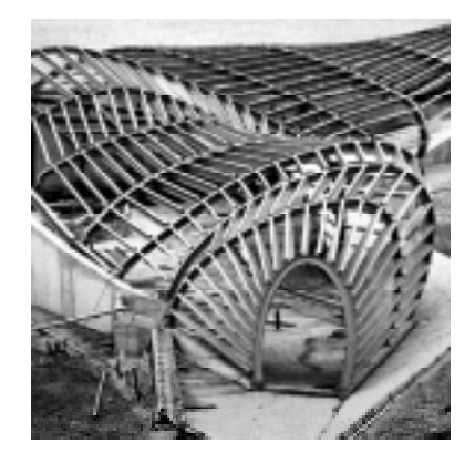
Fig 4. Use of ruled surfaces in the Water Pavilion by NOX.

Zellner, Peter, Hybrid Space: New Forms in Digital Architecture, New York: Rizzoli, 1999.