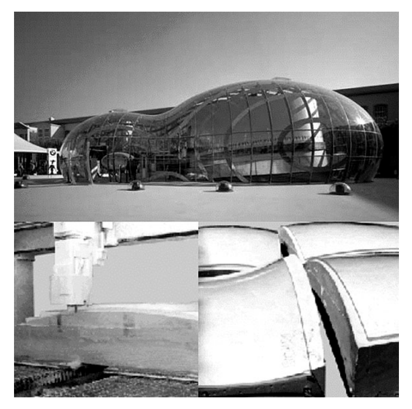
Fig 6. Milling of molds for acrylic glass panels in Bernard Franken's BMW pavilion.