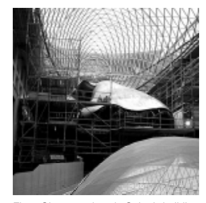
Fig 3. Glass envelope in Gehry's building in Berlin produced by triangulation.

Prototyping, Material Technology, vol. 13(2), p. 53- 56, 1998.