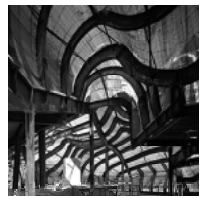
Fig 2. Structural frames in Gehry's building in Seattle produced by contouring.

The CNC-driven production processes have also introduced into architectural discourse the new "logics of seriality," i.e., the local variation and differentiation in series, and "mass-customization" instead of mass-production, i.e., the ability to mass-produce irregular building components with the same facility as standardized parts. It is now possible to produce "series-manufactured,