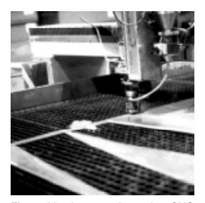
Fig 1. Aluminum cutting using CNC water-jet technology.

geometric complexities, which has led to a renewed interest in surface or shell structures in which the skin absorbs all or most of the stresses. That in turn prompted a search for "new" materials, such as high-temperature foams, rubbers, plastics, and composites, which were until recently rarely used in building industry. Thus an interesting reciprocal relationship is established between the new geometries and new materialities: new geometries opened up a quest for new materials and vice versa. More importantly, the "new" materiality promises a radical departure from Modernism's ideals, as noted by Giovannini [2000]: