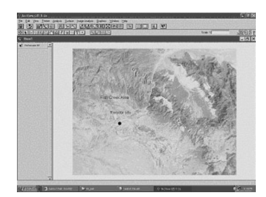
Figure 2. Landsat imagery showing specific location.