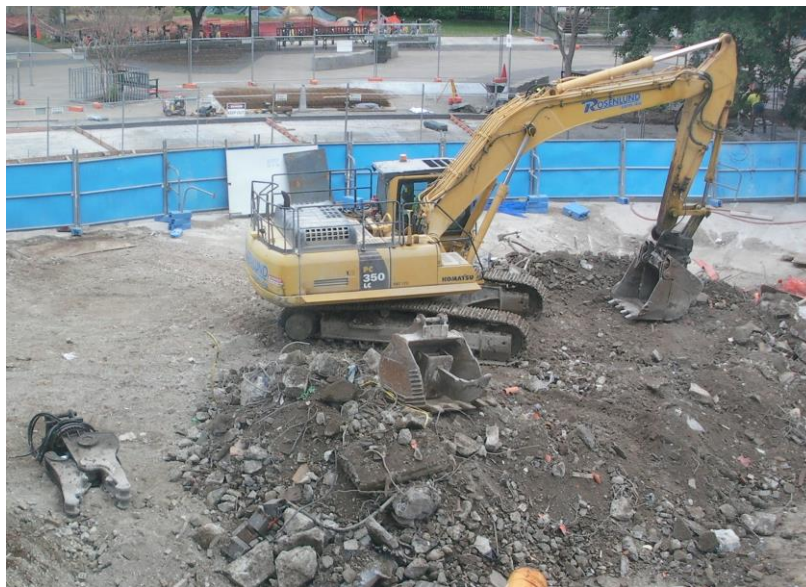
Figure 2: Excavator with attachments