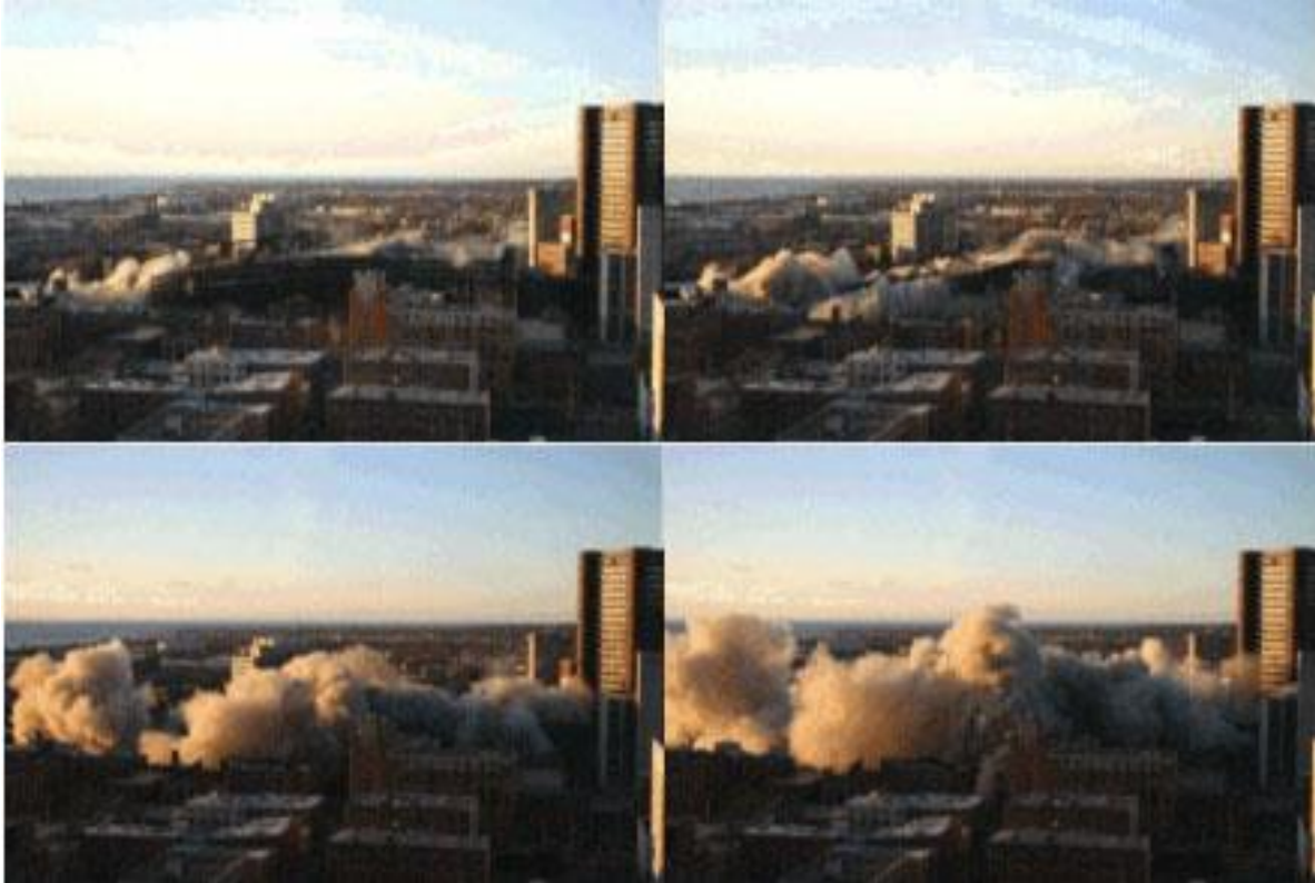
Figure 3: New Hampshire Coliseum - controlled demolition

4D modeling, which links exactly these two components, construction activities and 3D CAD building elements, can effectively support the planning of deconstruction activities, including the consideration of impacts on the local environment due to emissions of noise, dust and vibrations as well as hazardous substances.