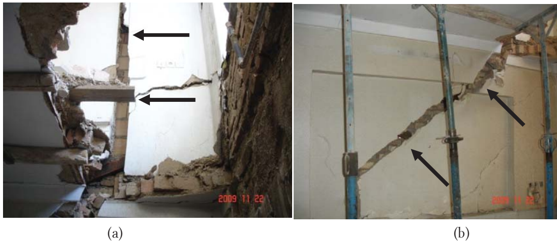
Figure 2: Sample of crack paths and point classification.

A few representation schemas can be conceivable relying upon the usage and the reasoning mechanism, which works on the model. For instance, it is likely to derive some fundamental features utilizing crack patterns, orientation, and width as a first step of crack classification algorithms (Tsai et al. 2012). Specifically, this paper concerns the representation of the crack path, width, and relative location of cracks on a given component surface (Figure 2).