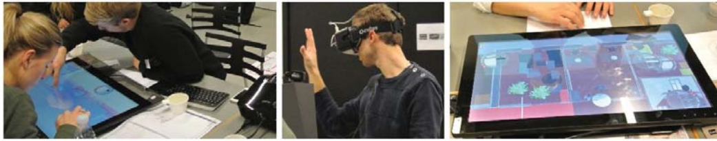
Figure 1: VR System and 2D Screen in simultaneous use

groups of 10), representing the management, employees, students and maintenance staff, as well as furniture providers and VR system developers.