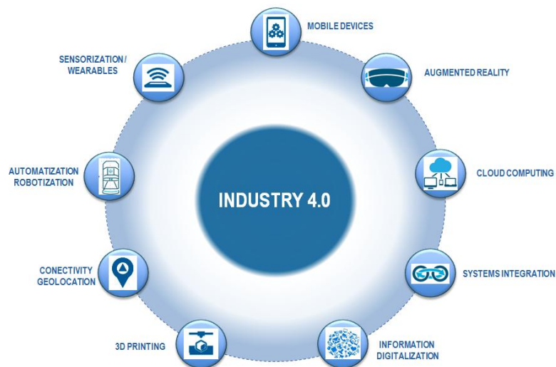
Figure 1: Technologies/Main principles of Industry 4.0 vision (Sousa, H.; Mêda, 2017)

Therefore the "digital transformation" process relies in technologies and methodologies to introduce digitalization on the value chains setting Digital Twins as the ultimate goal. The same vision is brought to the CI at all levels from products or tasks to facility or built environment levels (CDbb, 2019). In what relates to technologies, the ones presented in Figure 1 have been placed at the forefront for adoption within the CI (PwC Portugal, 2016) (Sousa, H.; Mêda, 2017).