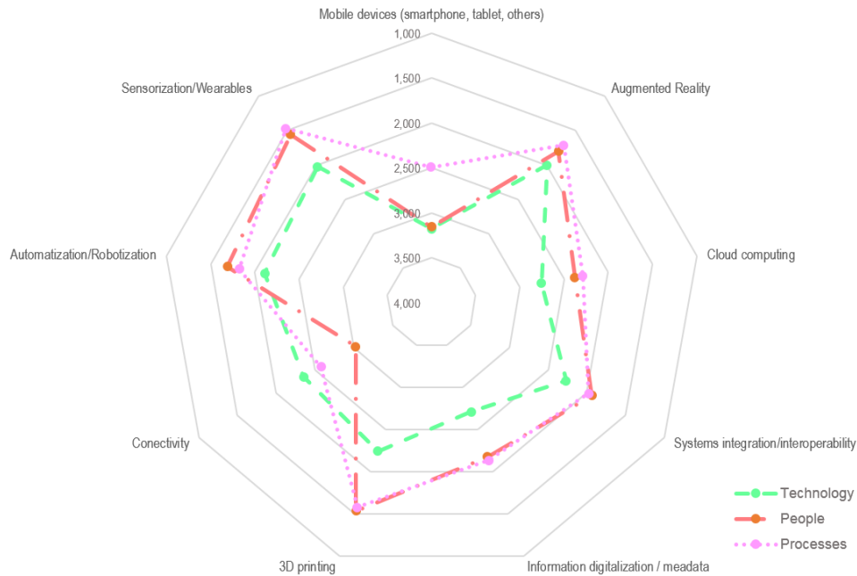
Figure 4: 2019 survey results.

“It is my feeling that “Augmented Reality” is evolving and expanding rapidly. This technology is being more and more adopted to support the design process as it allows professionals to take advantage of the visualization potential to identify problems prior to construction, allowing their correction. This streamlines and speeds up the construction stage as well as contributes to the quality of the final product. At “people level” stakeholders understand that this is a tools that raises efficiency and supports decisions. Interfaces and training for improved design processes are key.”